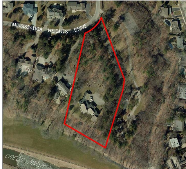
Aerial Image of 904 Mississauga Heights Drive

There were some technical matters that needed to be resolved before the Planning and Building Department could make a recommendation on the applications. Given the amount of time since the public meeting, and the changes to the applications, full notification was provided.