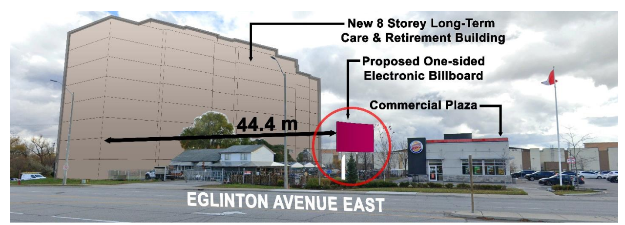
The proposed electronic billboard and the new 8-storey long-term care and retirement building

(23.0 ft. x 11.5 ft.), has a sign face area of 24.5 m^2 (363.7 ft<sup>2</sup>), and a height of 7.6 m (24.9 ft.) (Appendix 2).