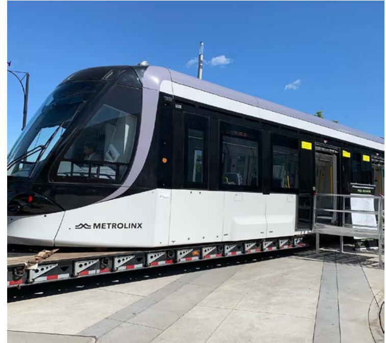
Vehicle Delivery and Testing