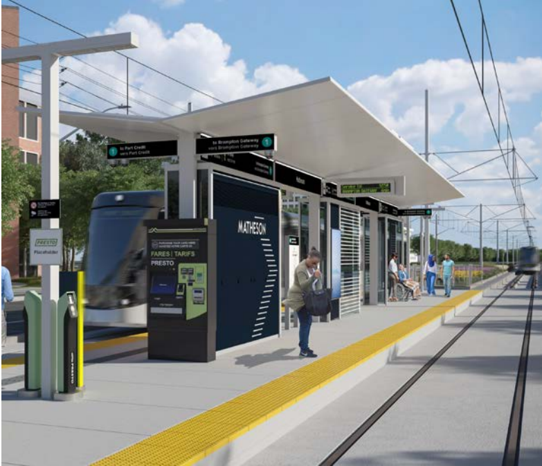
Station and Stop Construction