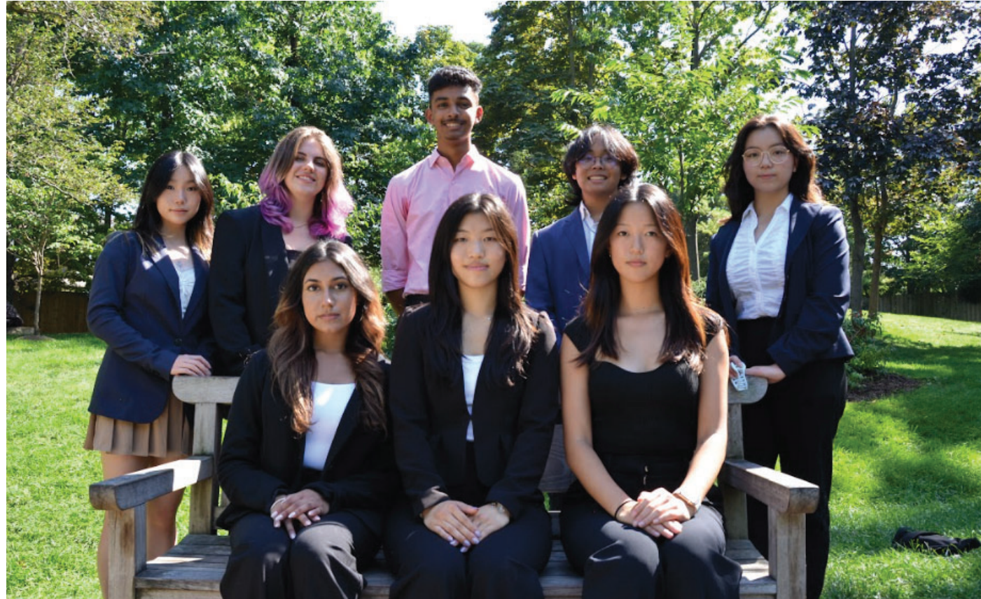
P03 | MYAC DEPUTATION: WHO WE ARE