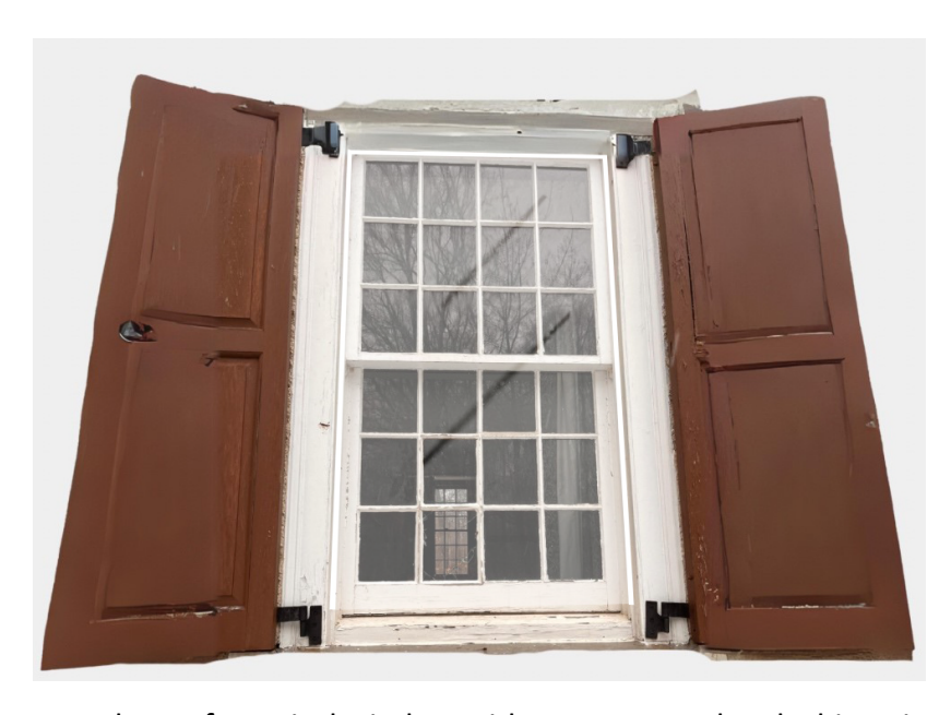
Mock-up of a typical window with a Lexan panel and white trim across the top and down the sides.