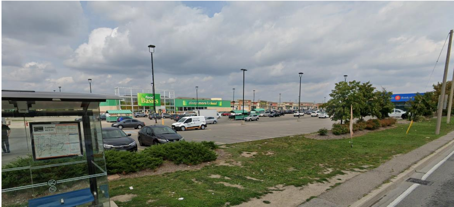
Looking northeast along Derry Road West directly north of the subject site