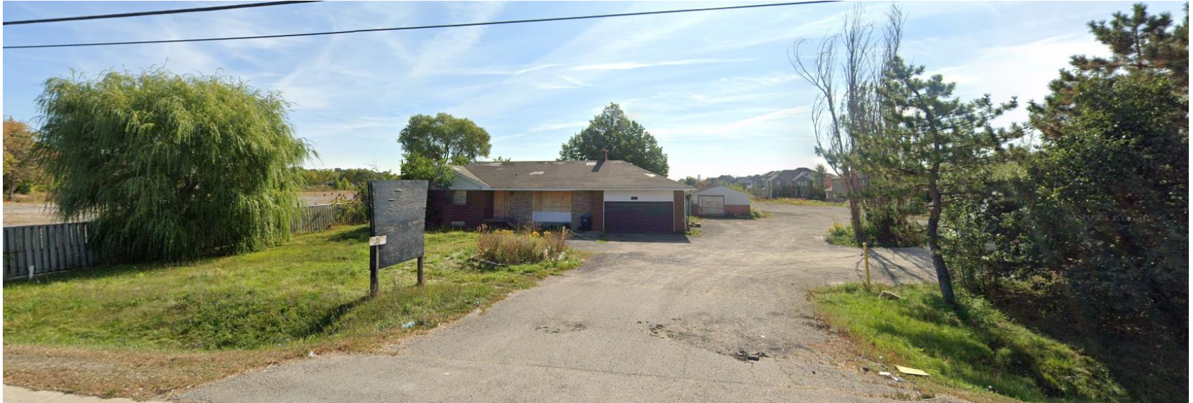
Existing site condition looking south to 376 and 390 Derry Road West