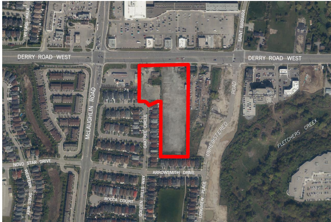
Aerial image of lands at 376, 390 Derry Road West and 0 Oaktree Circle