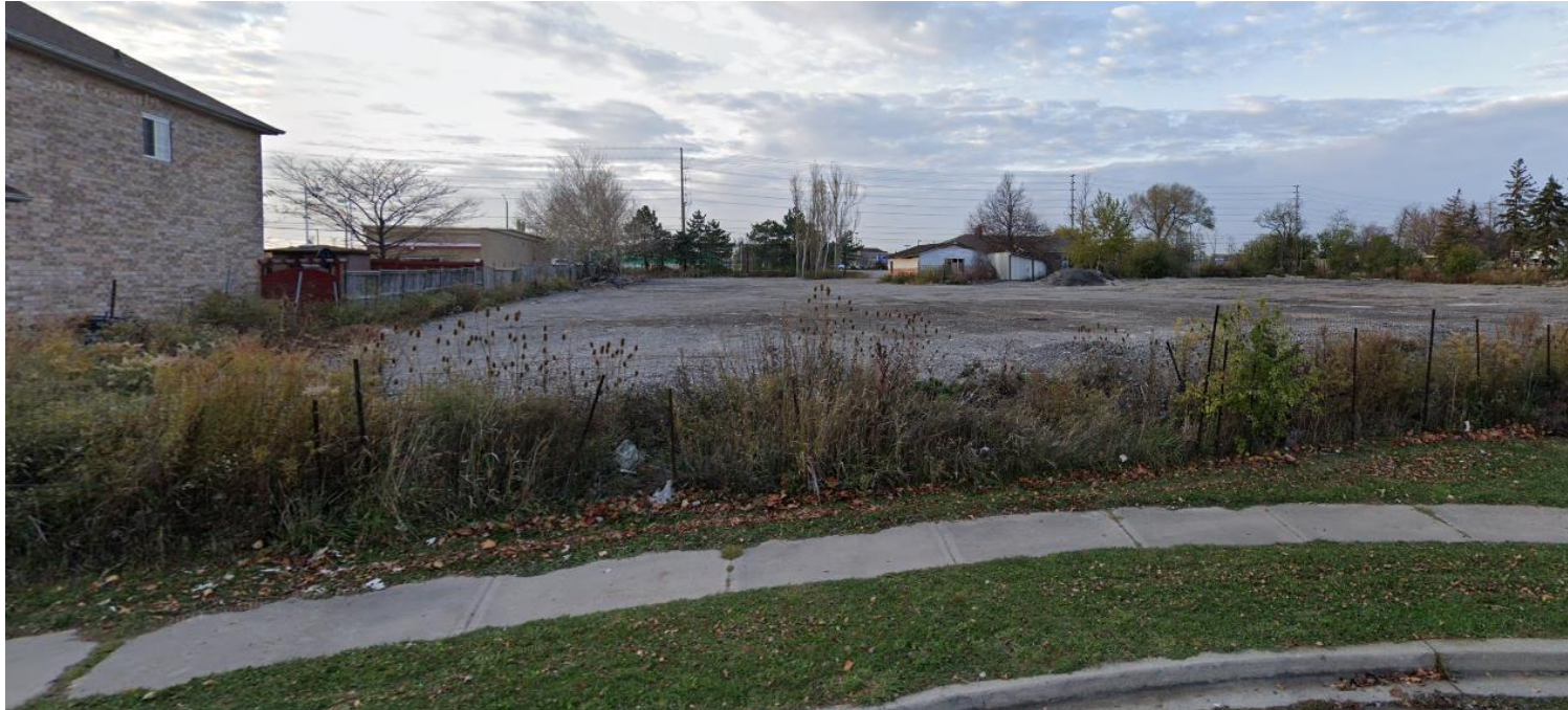
Existing site condition looking north to 0 Oaktree Circle