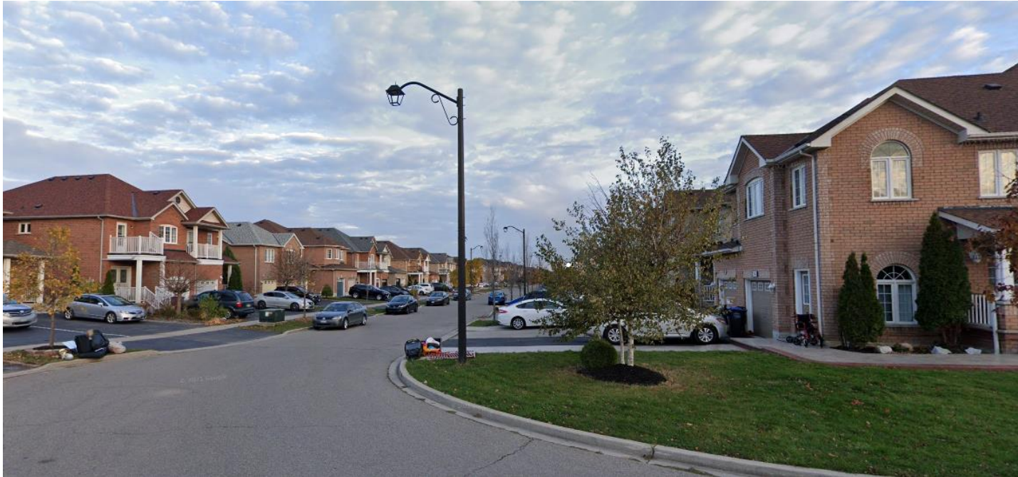
Looking south along Oaktree Circle, southwest of the subject site