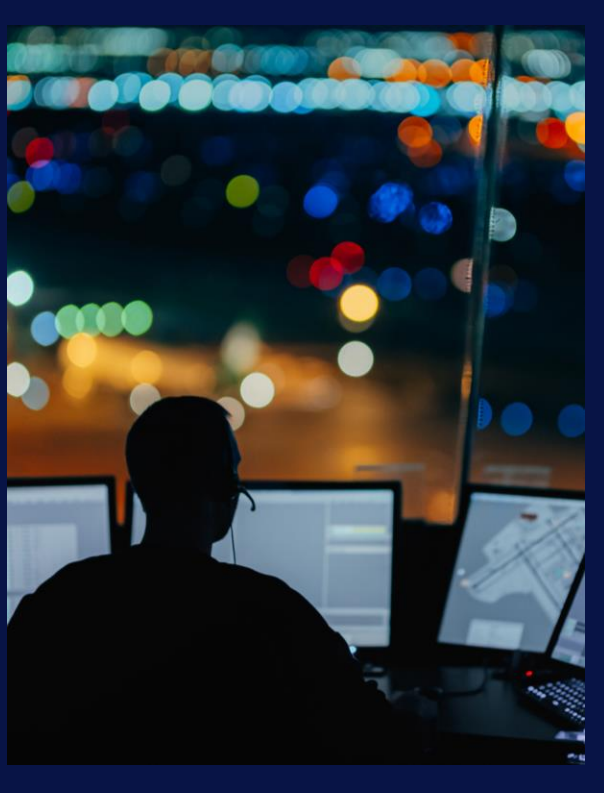
Built for the digital age