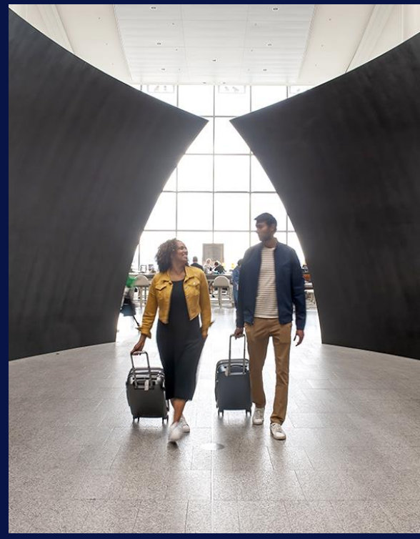
Exceptional customer experience