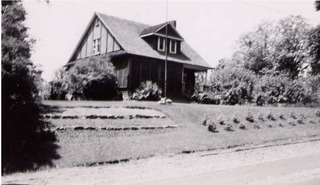
Southeast side of George Hodgetts House, 866 Clarkson Road South.