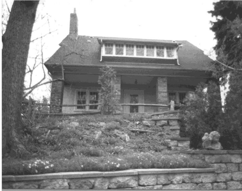
North side, 838 Clarkson Road South, 1989.