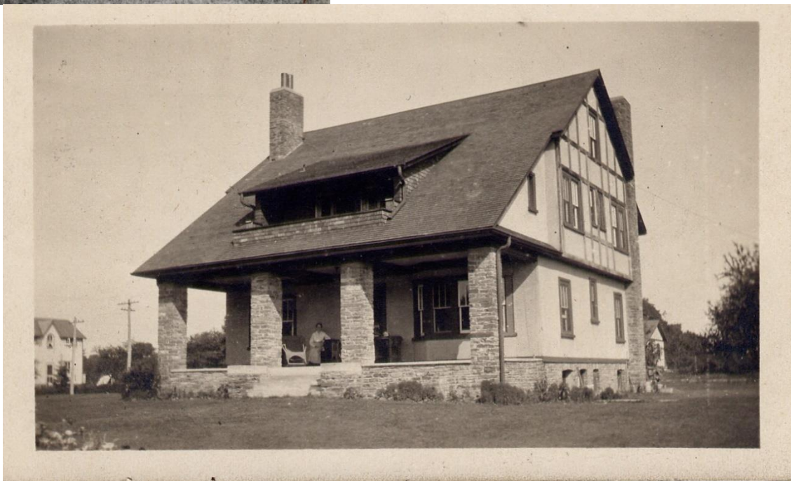
Northwest side of Percy Hodgetts House.