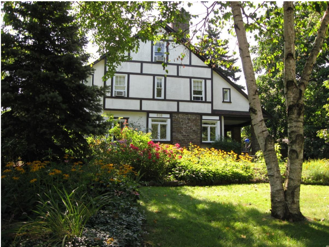
East side, 838 Clarkson Road South, September 2009.