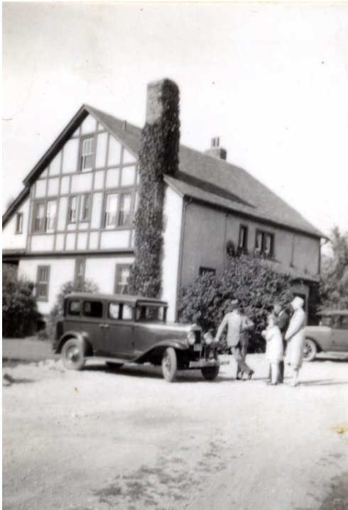
Southwest side of Percy Hodgetts House.