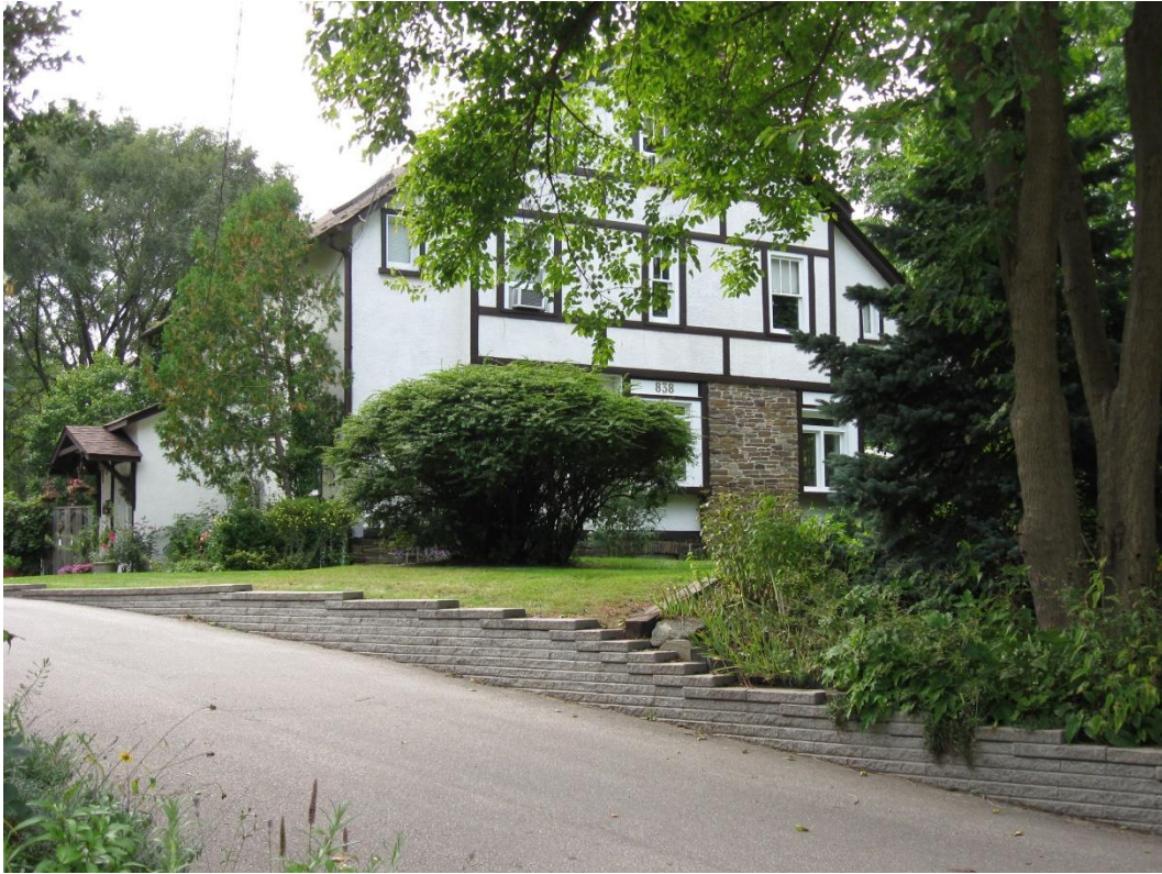
Southeast side, 838 Clarkson Road South, October 2009.