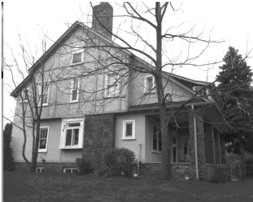
Northeast side, 838 Clarkson Road South, 1989.