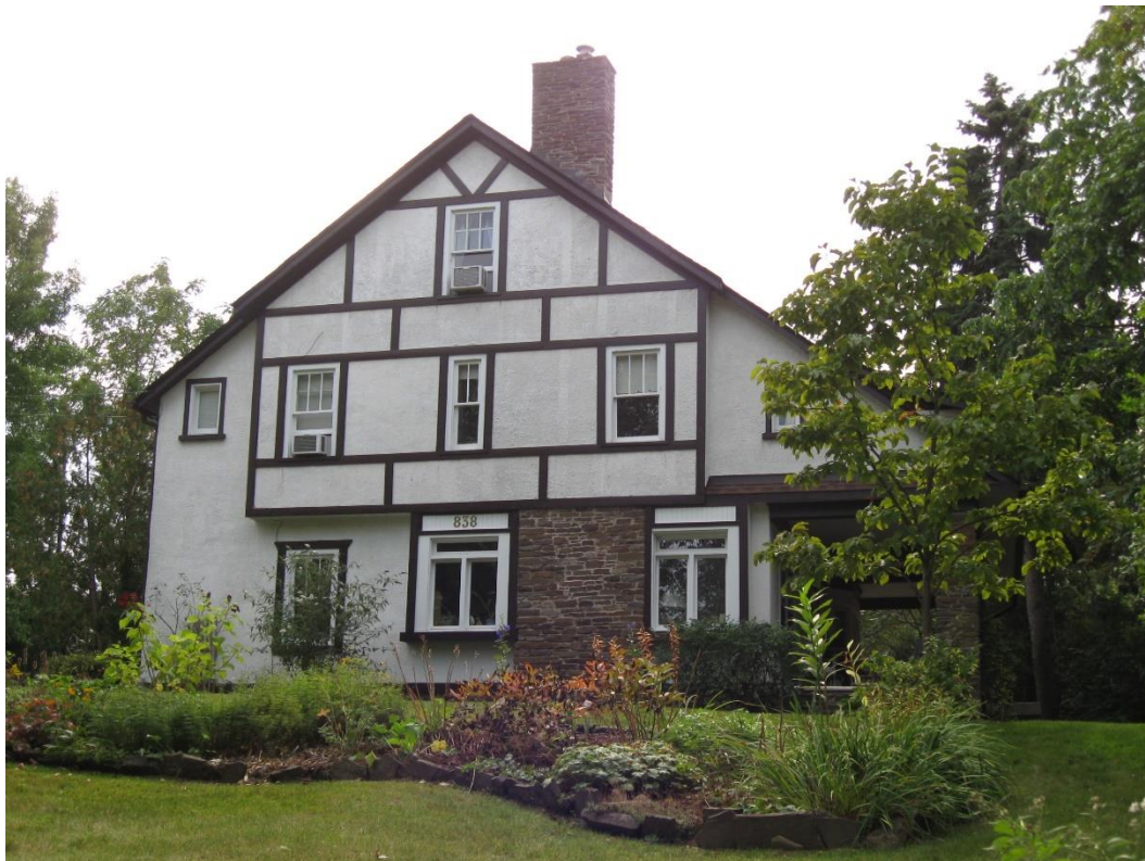
East side, 838 Clarkson Road South, October 2009.