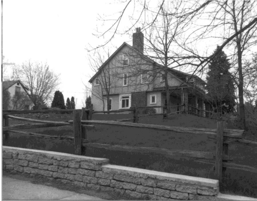
Long shot of 838 Clarkson Road South, 1989.