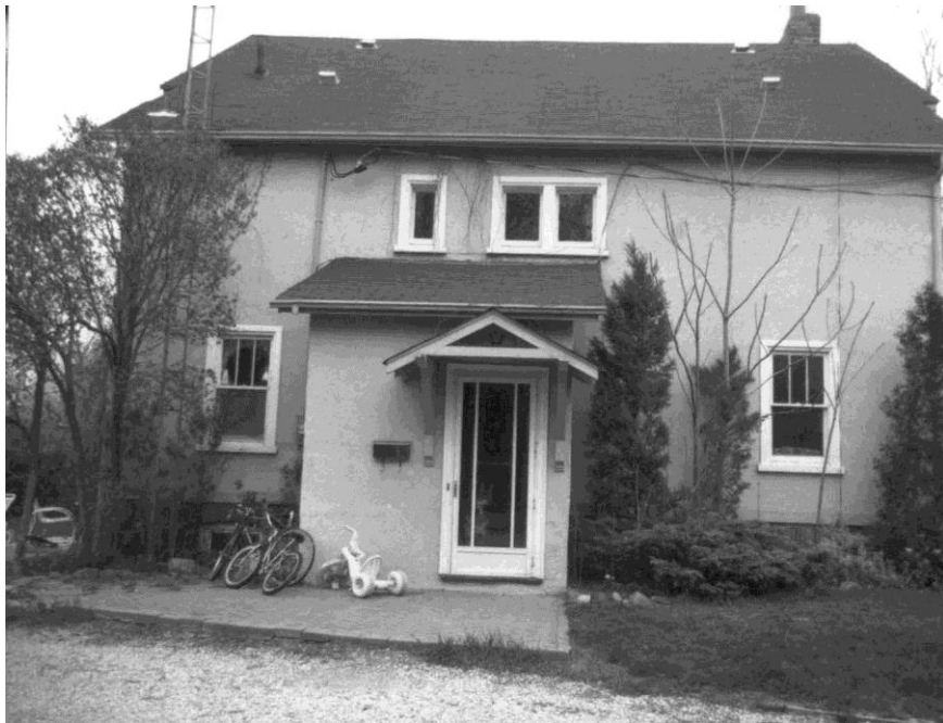
South side, 838 Clarkson Road South, 1989.