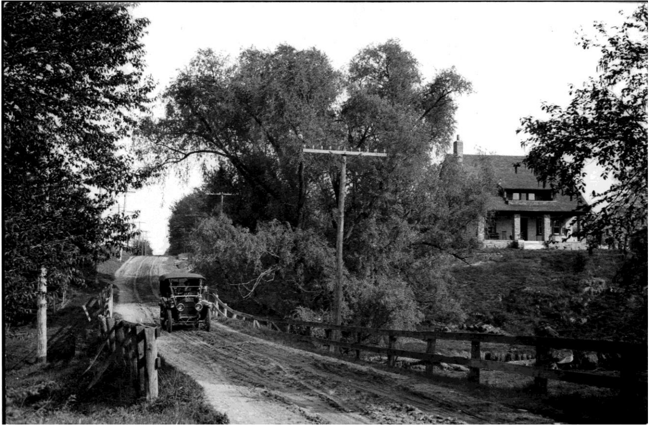
Clarkson Road South and north side of Percy Hodgetts House, c. 1920.