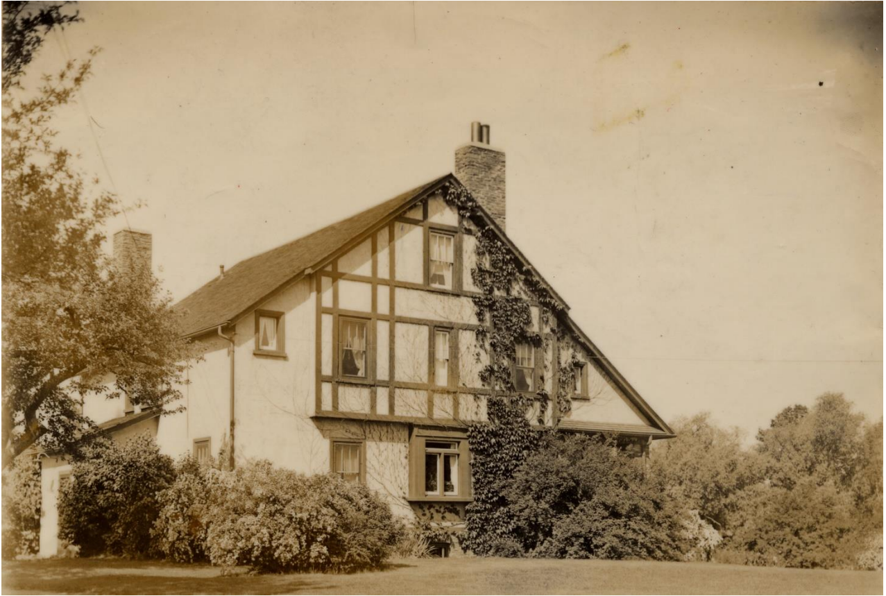
Southeast side of Percy Hodgetts House.