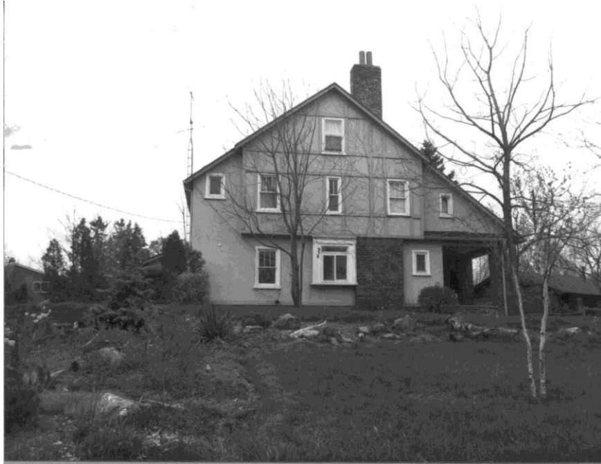
East side, 838 Clarkson Road South, 1989.