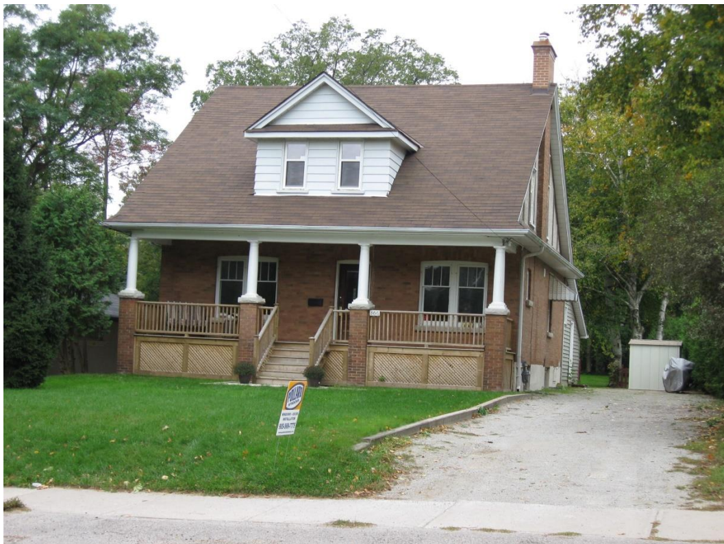
East side of 866 Clarkson Road South, October 2009.