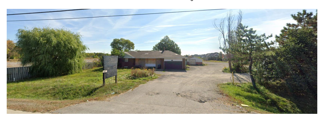
Photo of Existing Site Condition (view south from Derry Road West)