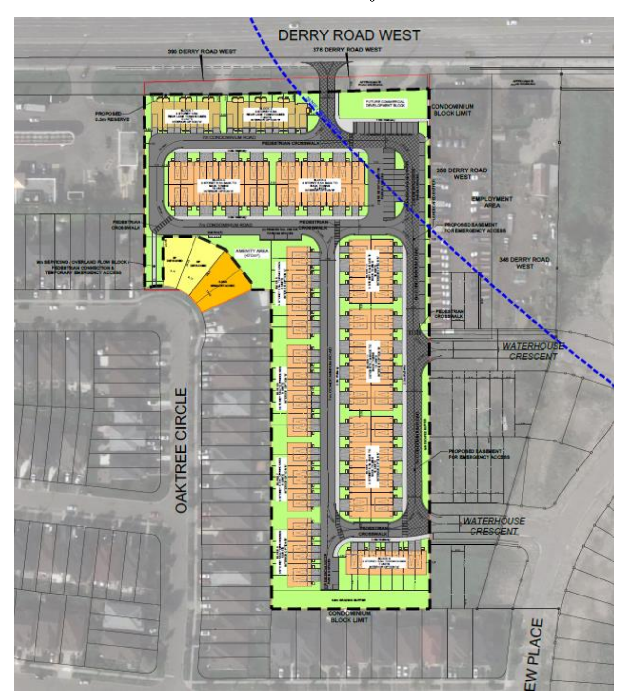
Concept Plan of Proposed Development