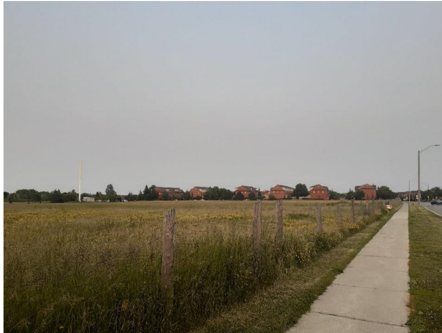
Existing site condition looking southeast along Lisgar Drive