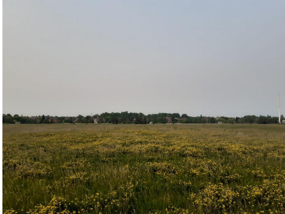
Existing site condition looking east from Lisgar Drive