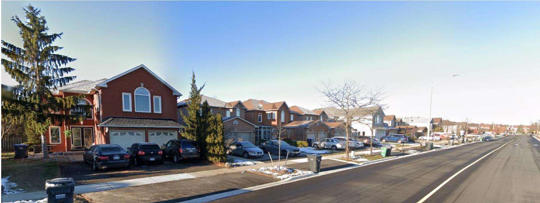
Looking northwest along Lisgar Drive directly opposite the subject site