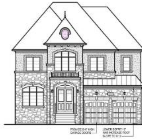
Proposed Detached Dwelling Front Elevations