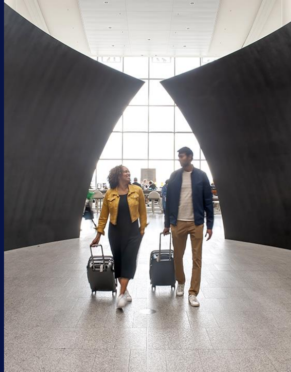
Exceptional customer experience