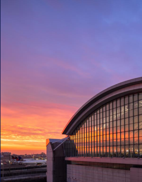
Future-proofed, smart design