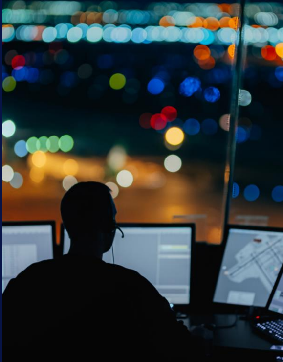
Built for the digital age