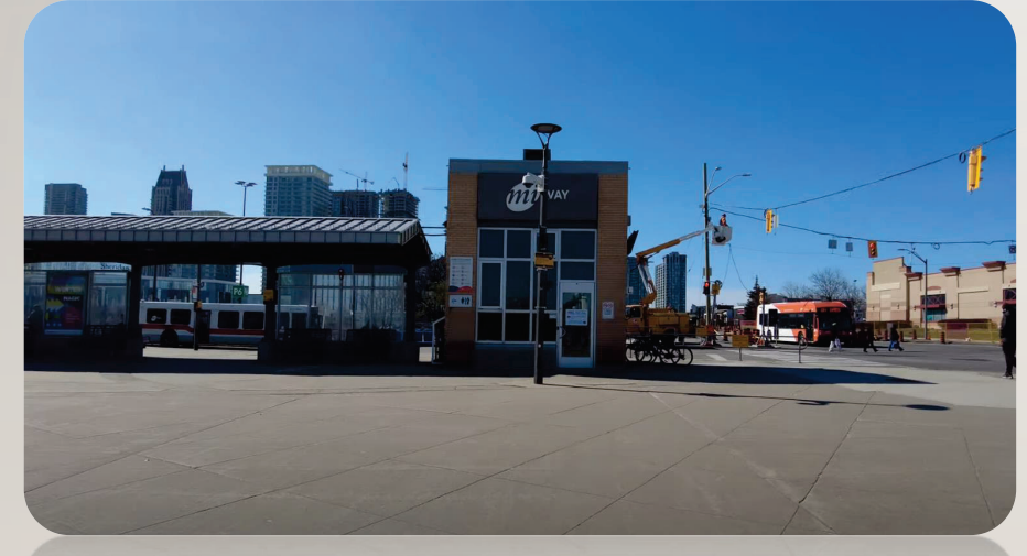
Platform area at Rathburn Rd: