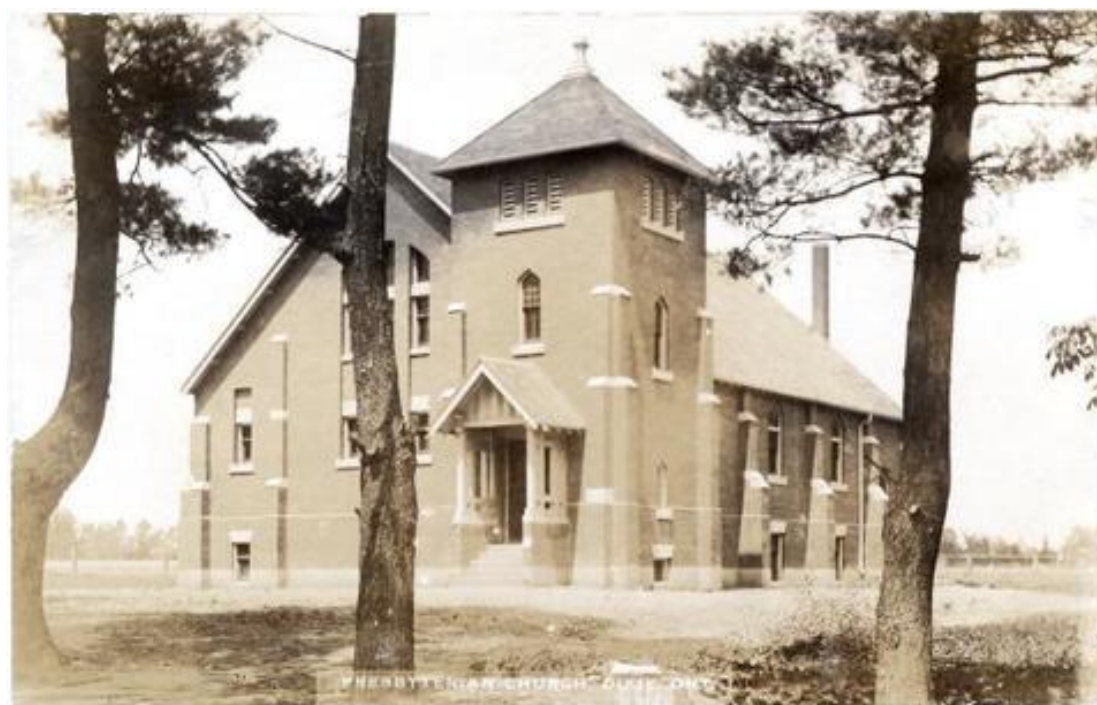
Dixie Presbyterian Church ca. 1930