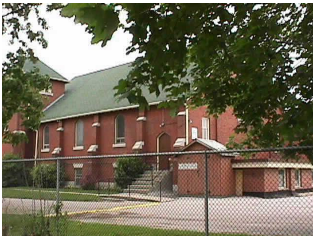
Back entrance another view City of Mississauga