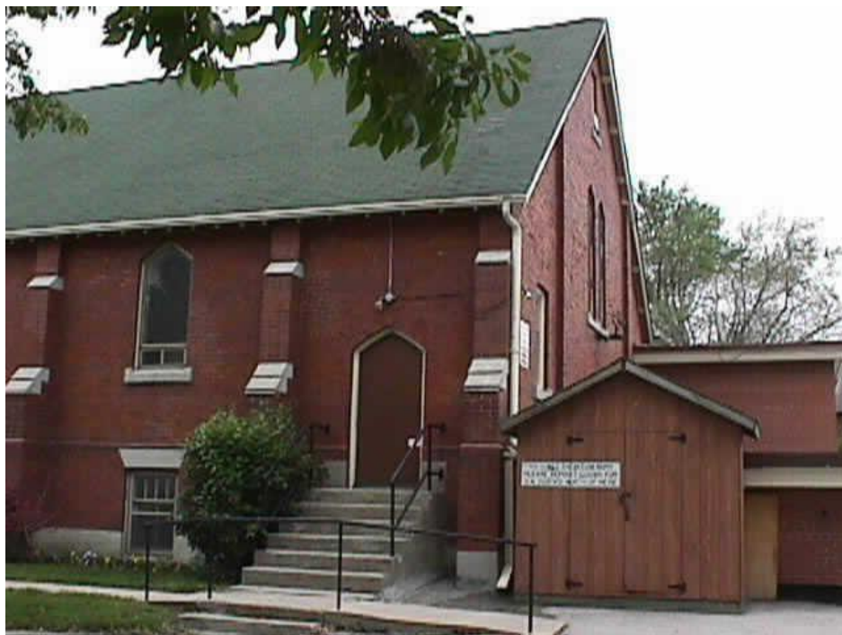
Back entrance City of Mississauga