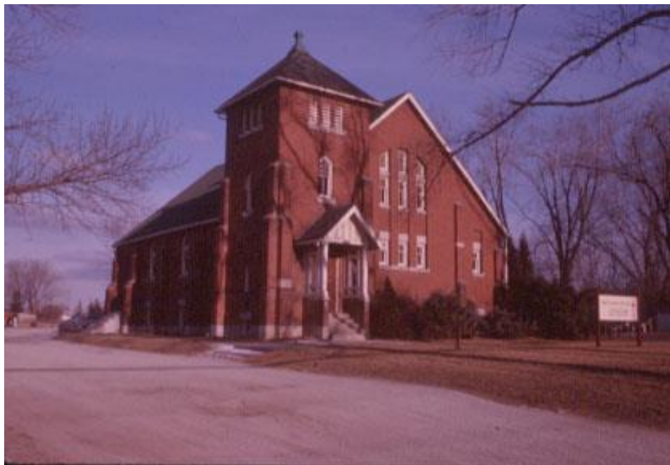
Dixie Presbyterian Church c. 1980 (from a slide- reversed?)

Mississauga Historic Image Gallery (A317)