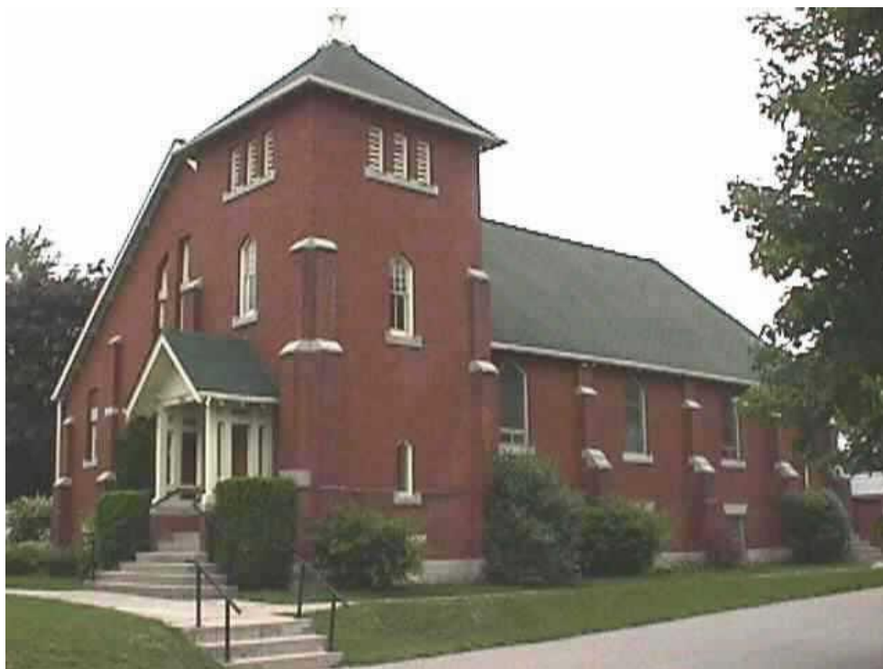
Side view of the front entrance City of Mississauga

Mississauga Historic Image Gallery (A317)