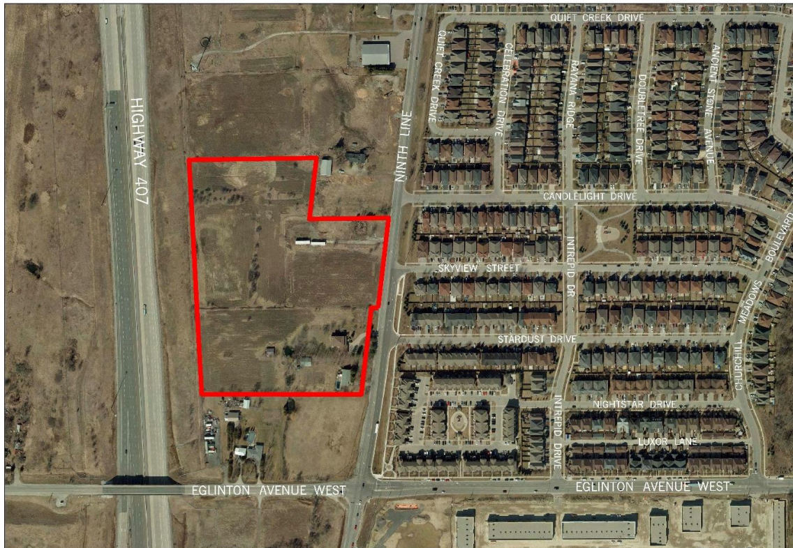
Aerial Image of 5034, 5054 and 5080 Ninth Line

There were some technical matters that needed to be resolved before the Planning and Building Department could make a recommendation on the applications. Given the amount of time since the public meeting, full notification was provided.