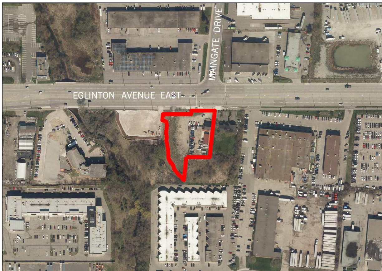
Aerial Image of 1094 and 1108 Eglinton Avenue East