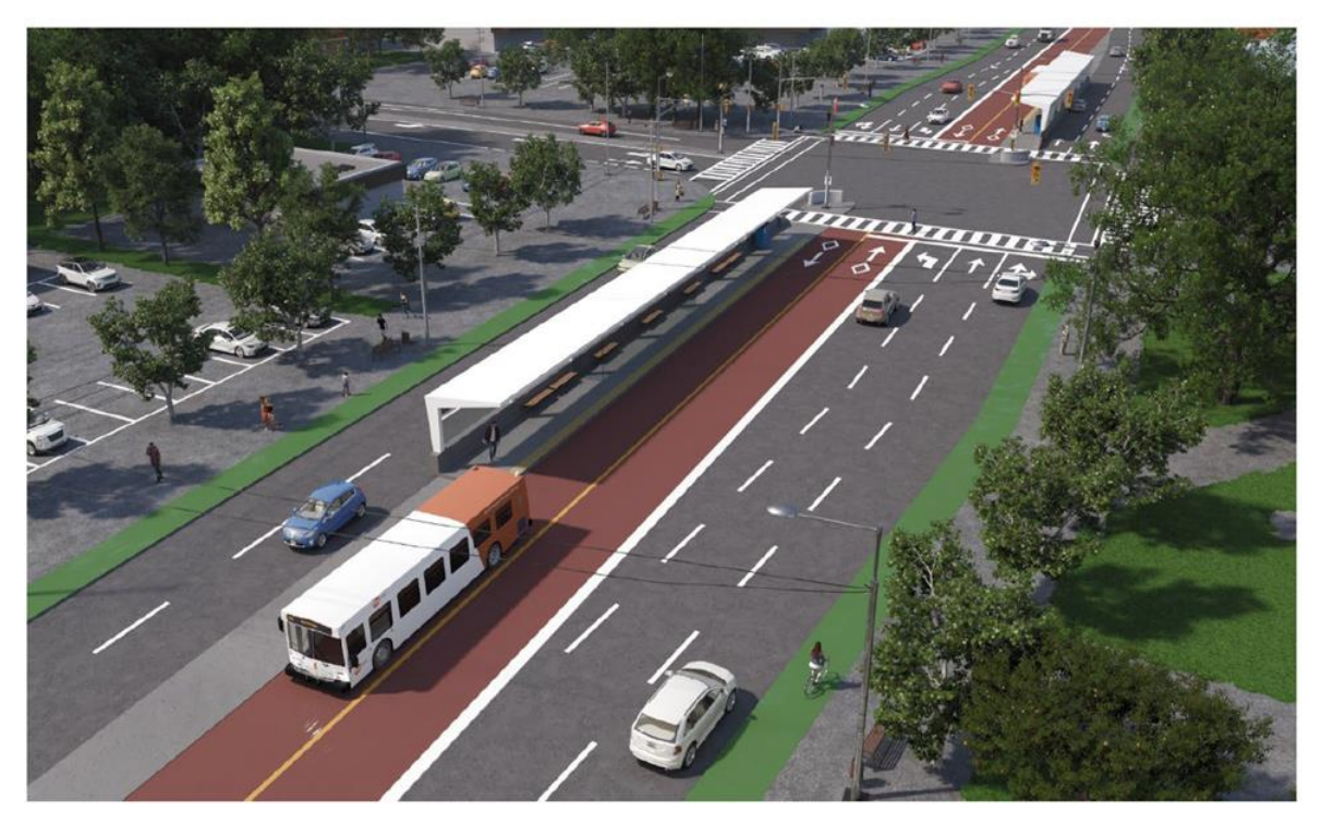
Figure 2: Dundas BRT and Far-Side Station Concept

In May 2018, City of Mississauga completed the Dundas Connects Master Plan, which established a transportation and planning vision for Dundas Street through a comprehensive consultation process. As recommended in the report titled 'Dundas Connects Master Plan' to General Committee on June 20, 2018 from the Commissioner of Transportation and Works. City Council subsequently endorsed the Dundas BRT Mississauga East project, which recommended median running BRT for a 7 km segment of the Dundas Street between Etobicoke Creek and Confederation Parkway. A rendering of the proposed Dundas BRT is shown below in Figure 2.