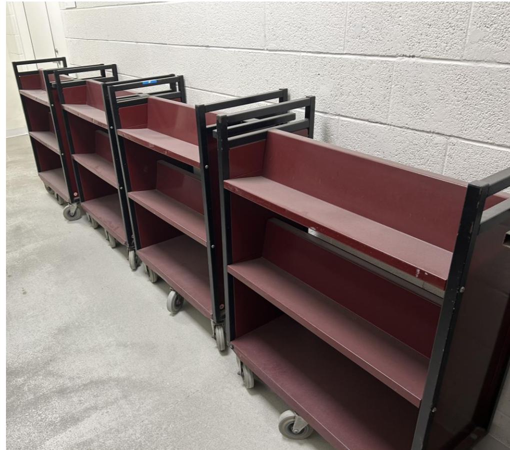
Library's book trucks and Culture's banners donated