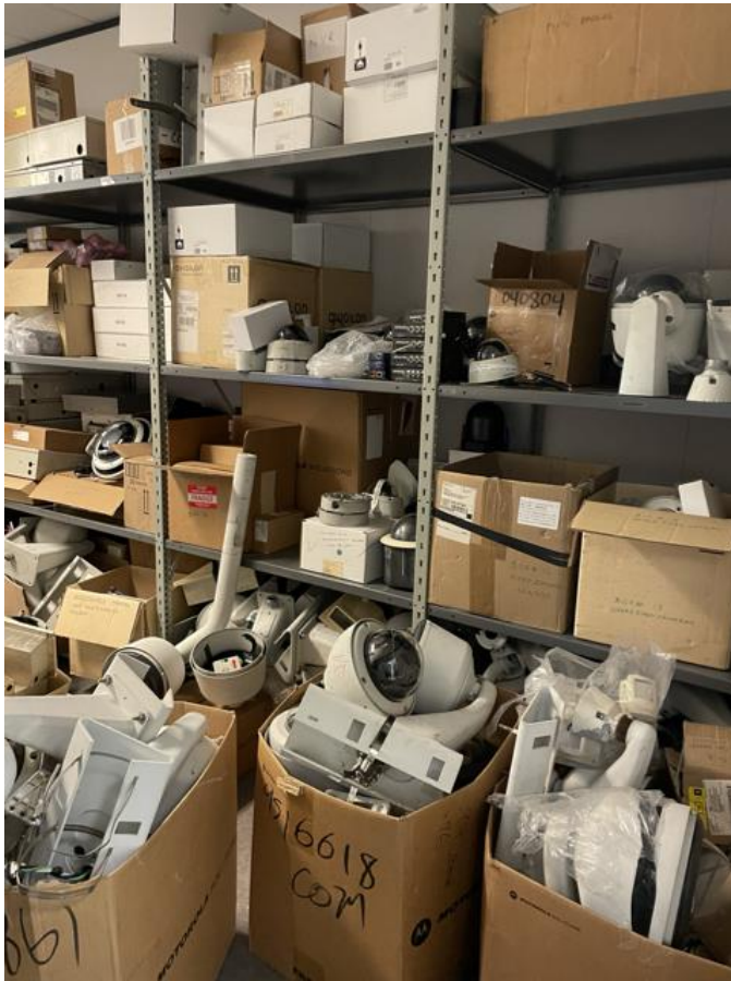
Security Cameras recycled