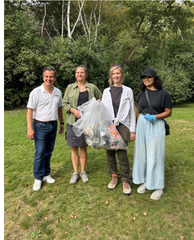
Litter Cleanup at Jack Darling Park: 5.25kg of garbage and 0.94kg of recycling collected