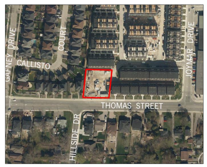
Aerial Image of 86 Thomas Street (April 2024)