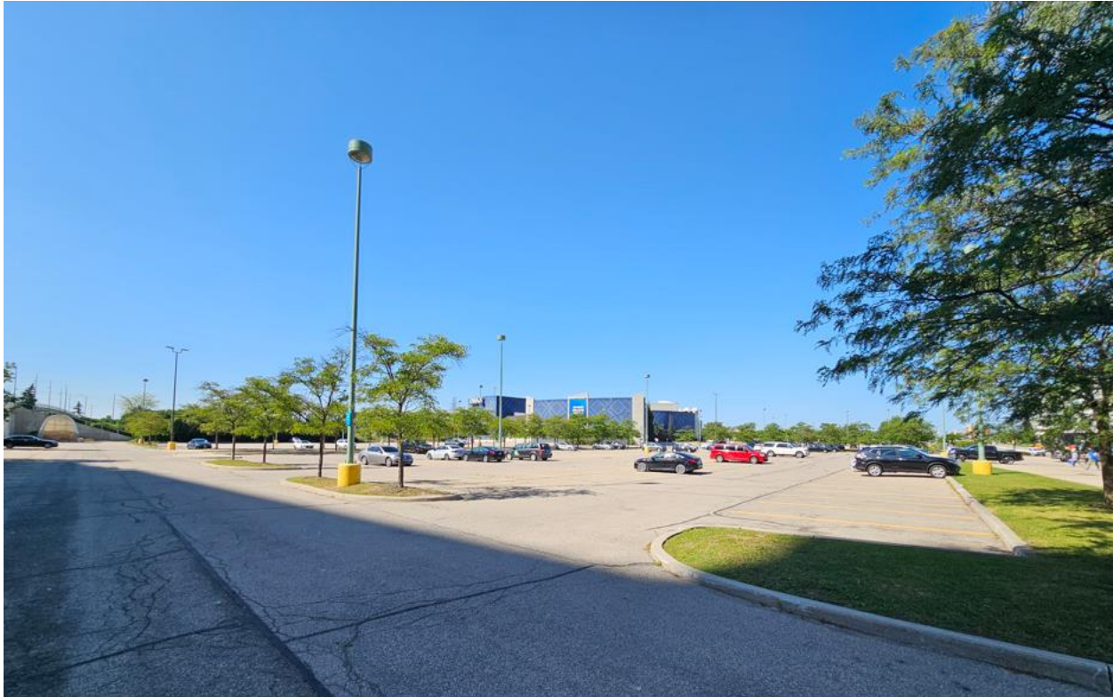
Photo of Existing Site Condition – lands north of Rathburn Road West (view facing northeast from Rathburn Road West and Confederation Parkway)