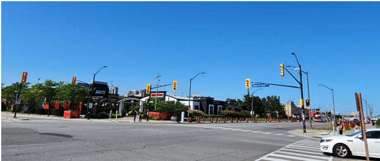
Photo of Existing Site Condition – lands north of Rathburn Road West (view facing northeast from Rathburn Road West and Duke of York Boulevard)