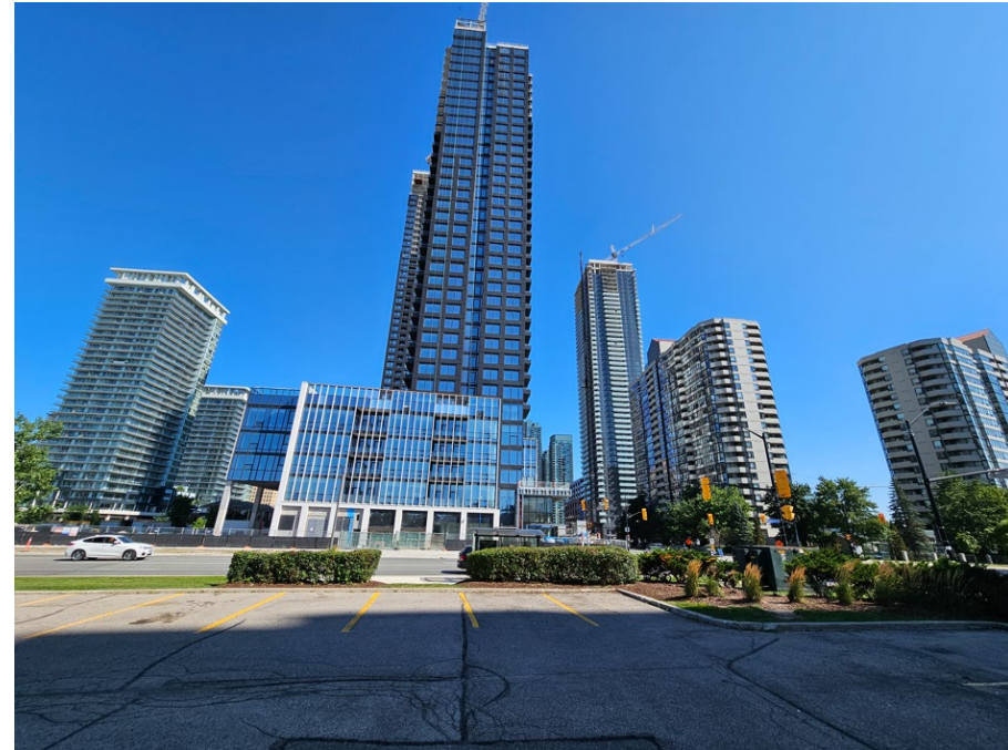
Lands to South at Rathburn Road West and Confederation Parkway (facing south)