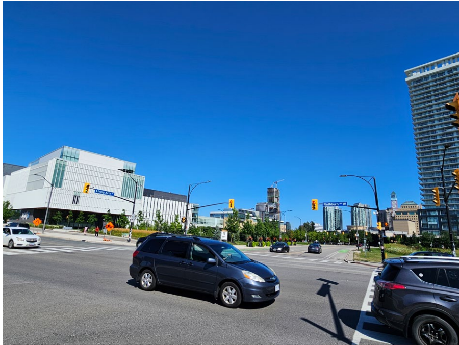
Lands to South at Rathburn Road West and Living Arts Drive (facing south)