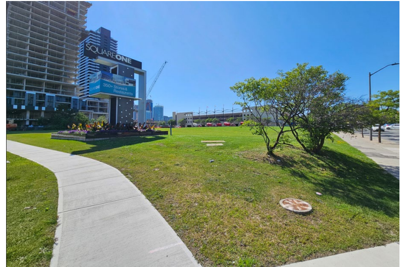
C. SW Corner of City Centre & Kariya Gate (facing northwest from Burnhamthorpe Road West and Kariya Gate)