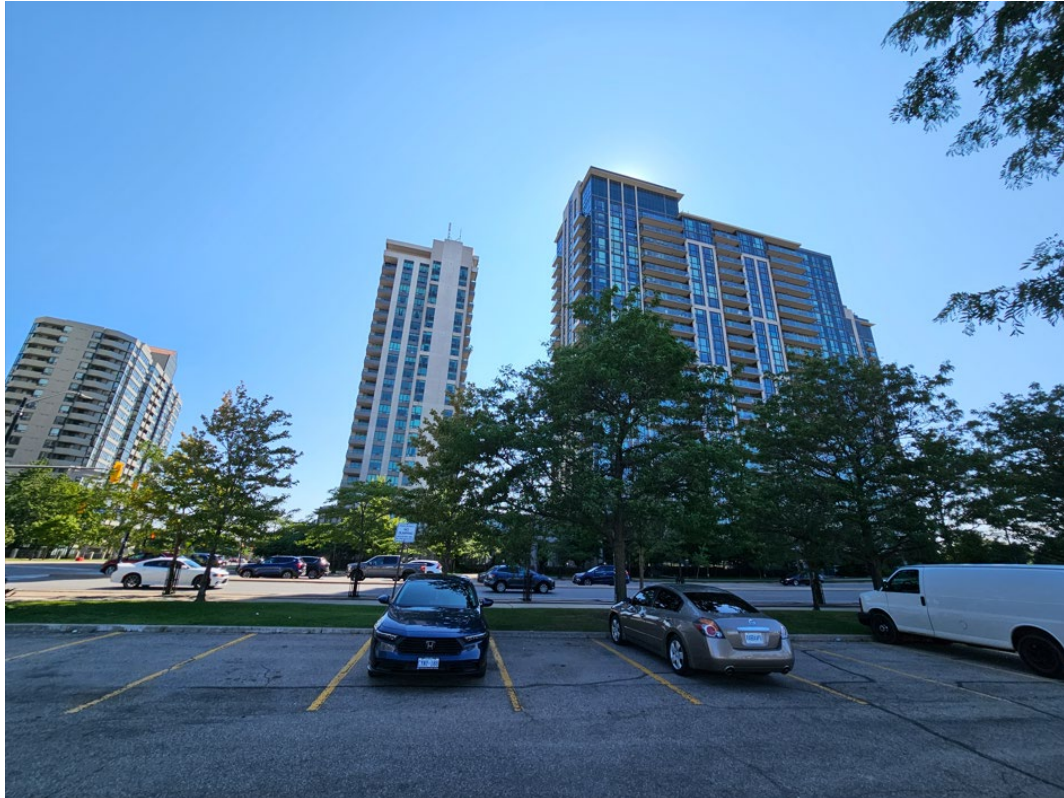
Lands to West at Rathburn Road West and Confederation Parkway (facing west)