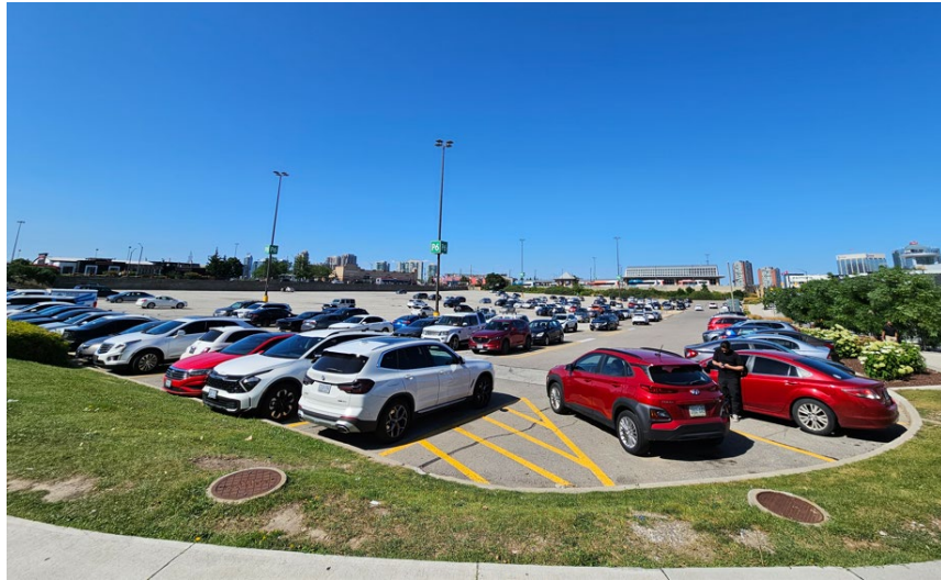
B. SE Corner of Rathburn & Duke of York (facing northeast from Square One Drive and Duke of York Boulevard)