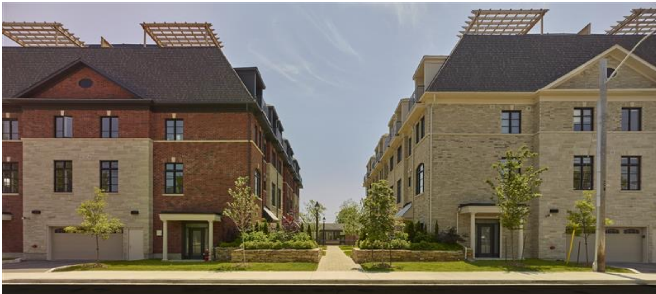
68 Daisy Avenue, Etobicoke Parking entrance