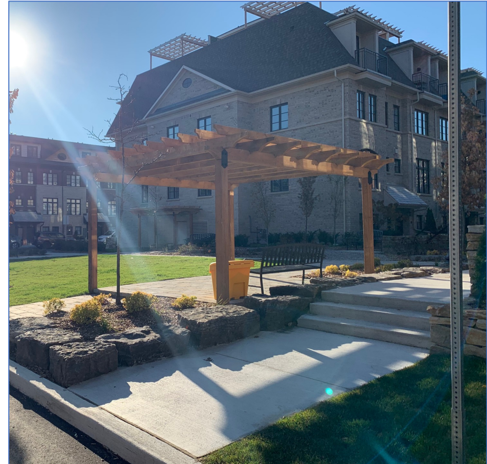
Amenity Space 1994 sq. m