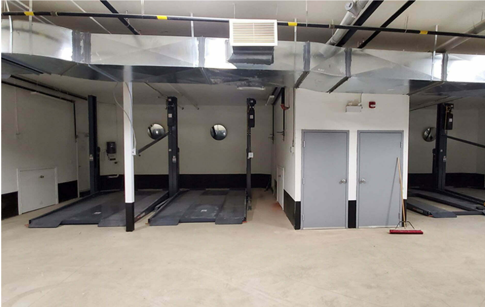
68 Daisy Avenue, Etobicoke Stacker parking