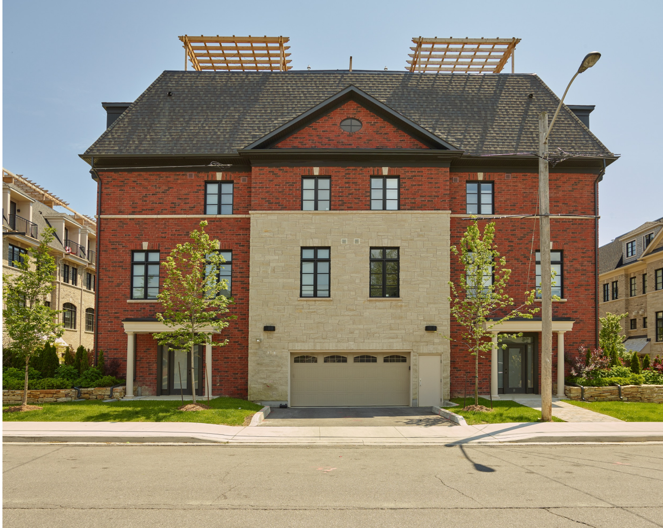
68 Daisy Avenue, Etobicoke Parking entrance