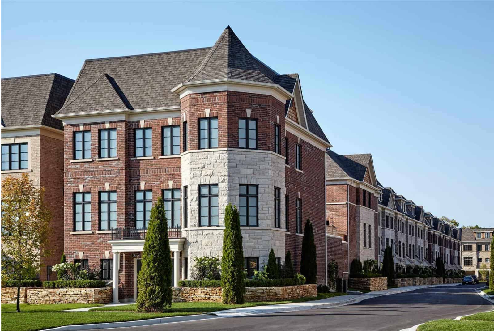
STREETSVILLE CENTRE, MISSISSAUGA ON 194 Townhouse Units, 3-Storey