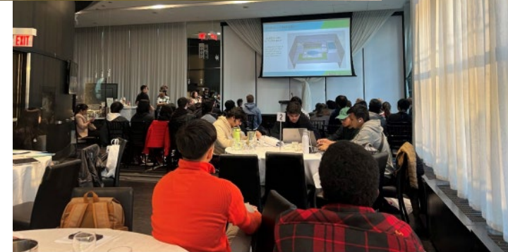
City of Mississauga Hackathon Challenge: Leveraging Rooftops to Adapt to Climate Change (November 26, 2024)