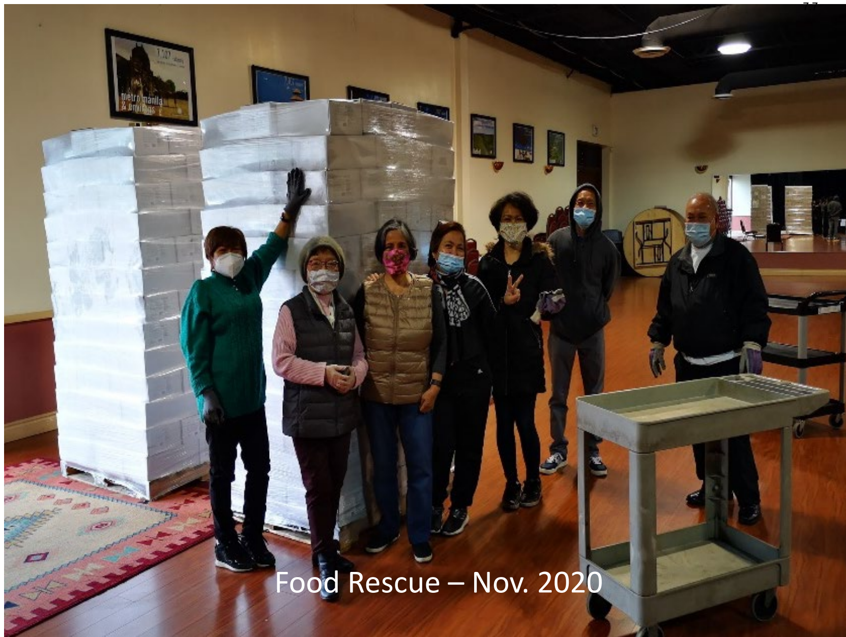
Food Rescue – Nov. 2020