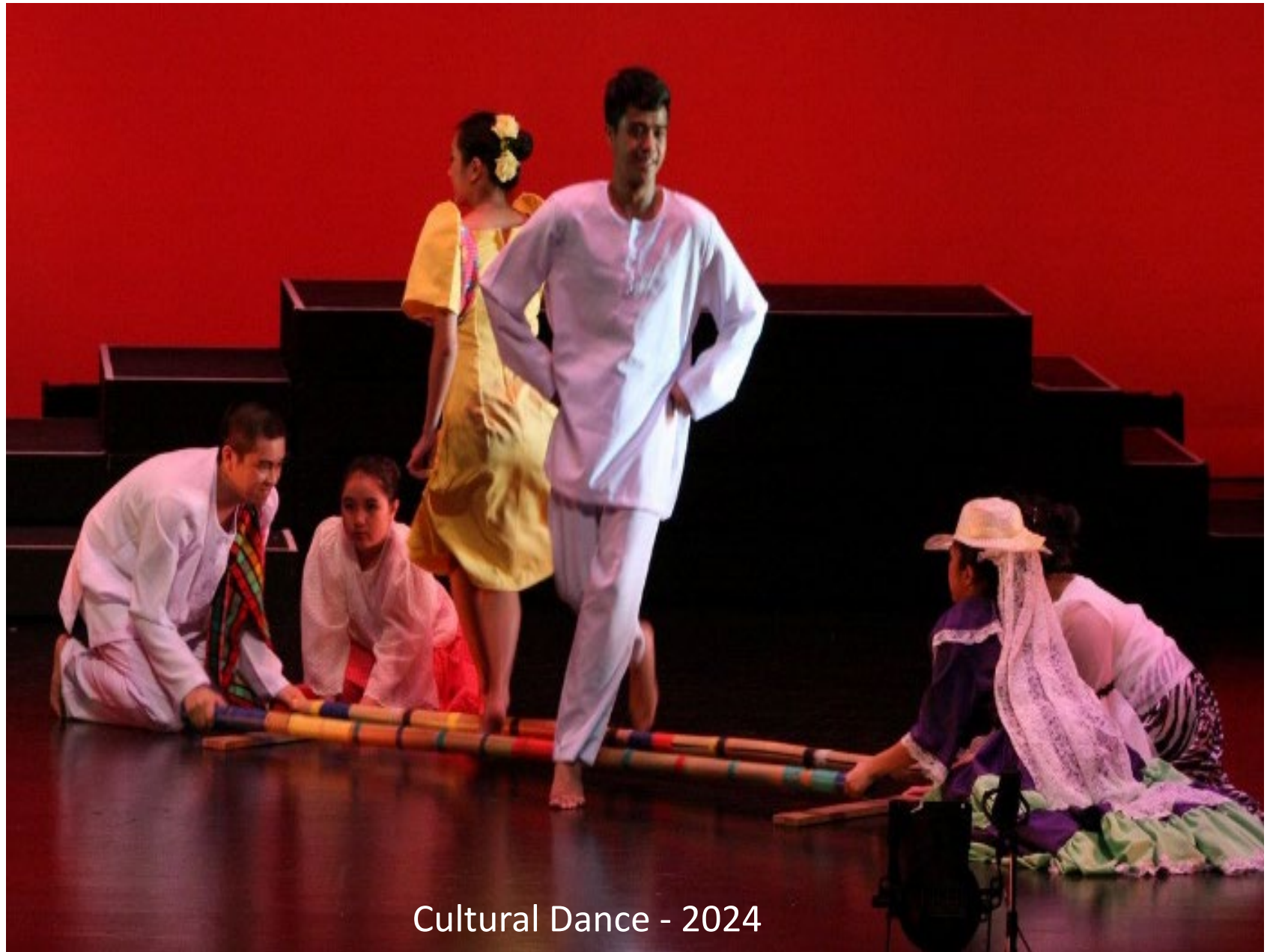
Cultural Dance - 2024