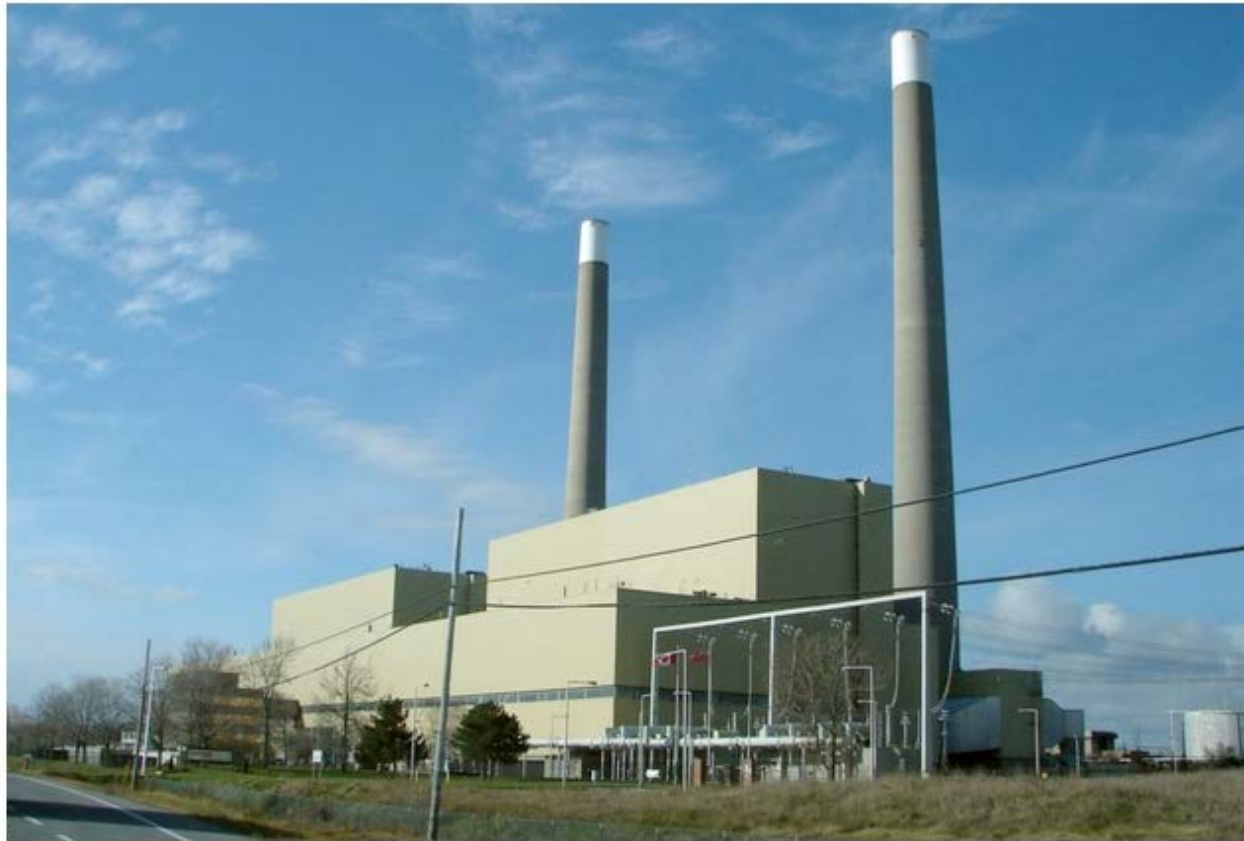
Lennox Power Station near Bath, Ontario, Canada. November 2010.