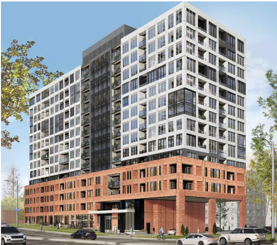
Perspective (Looking southeast)