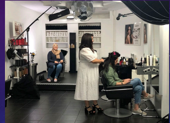
Image 2: Behind-the-Scenes of the Moroccan-Arabic culturally-sensitive education video for informing on cervical cancer screening