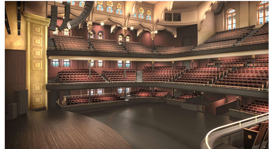
Massey Hall – flexible seating