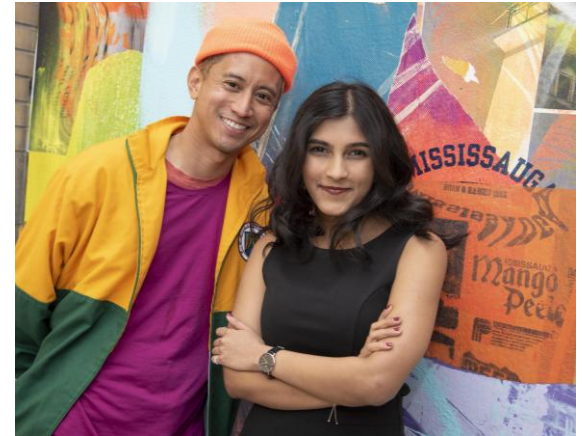
Murals at Civic Centre Skate Park