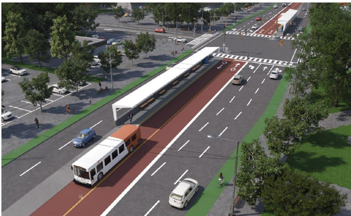
Figure 1: Dundas BRT and Station Concept

The Dundas BRT Mississauga East received a Notice to Proceed from the Provincial Government in April 2022 following the completion and approval of the Transit Project Assessment Process (TPAP). The 30% preliminary design was completed in early 2024. Updates to the project scope include the new provincial housing mandate and additional water and wastewater infrastructure from the Region of Peel. The Detailed Design Request for Proposal (RFP) for the Dundas BRT Mississauga East was released in September 2024, with study commencement in March 2025. Detailed design, early works, and other preparatory activities are expected between 2026 and 2027, with phased construction anticipated to begin in 2027.