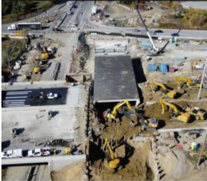
PORT CREDIT AND QEW PUSHBOX