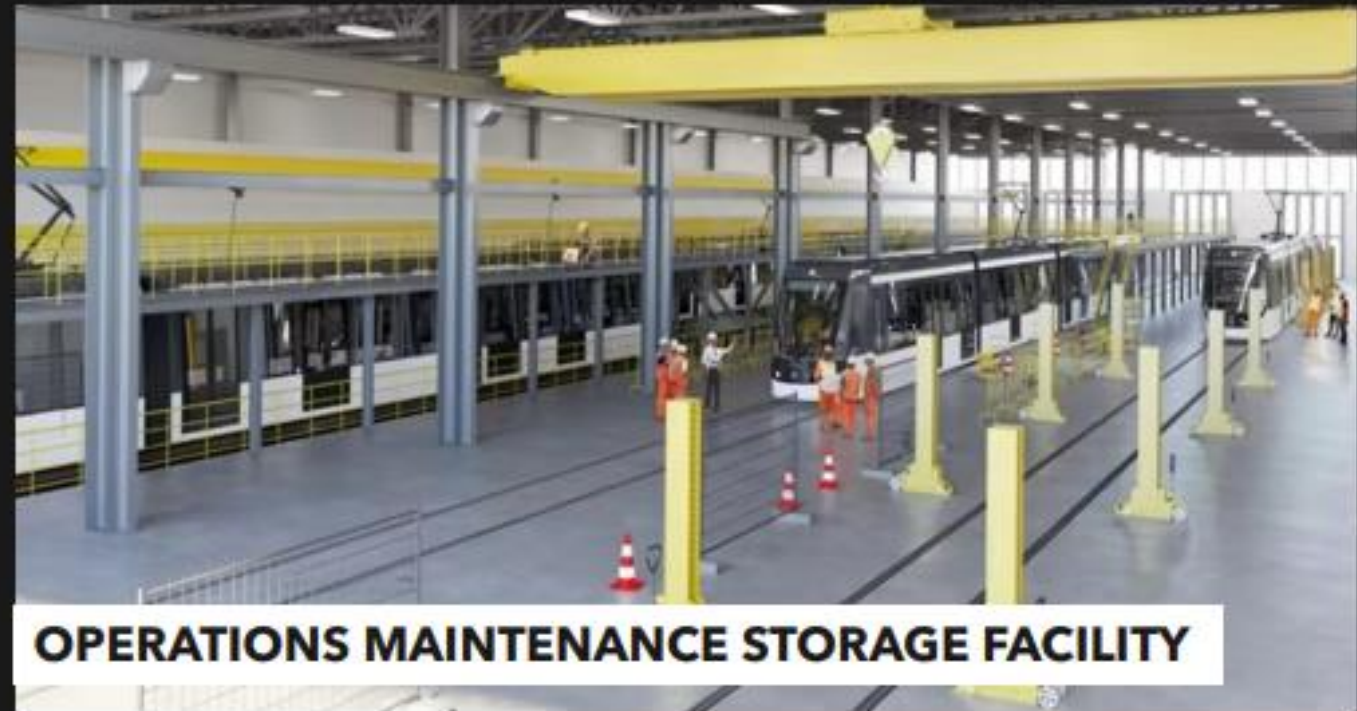
OPERATIONS MAINTENANCE STORAGE FACILITY