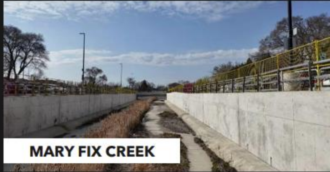
MARY FIX CREEK