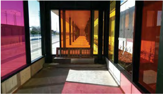
Artful Public Realm