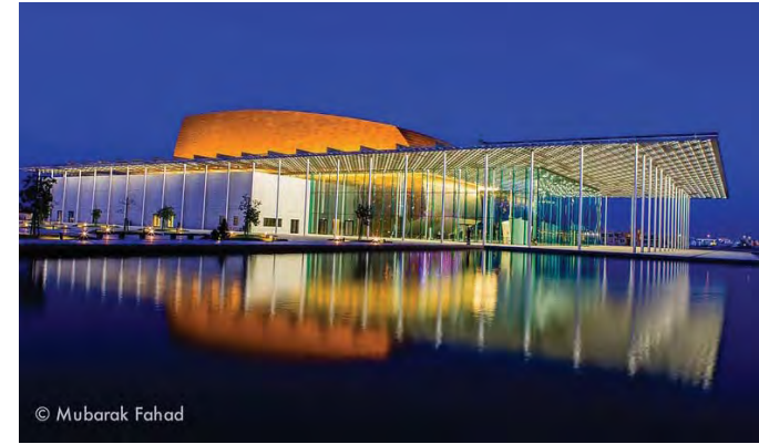
Anchor Arts Organizations & Entertainment Facilities