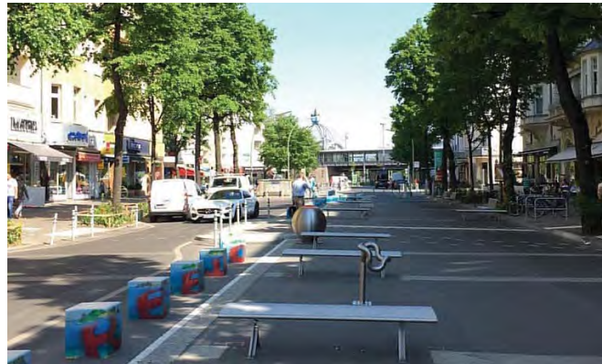
Mix of Land Uses