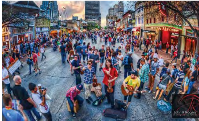
Vibrant Walkable Streets