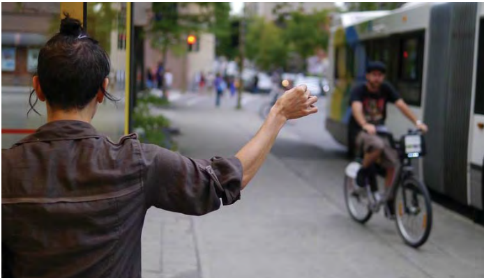
Close Proximity to Transit