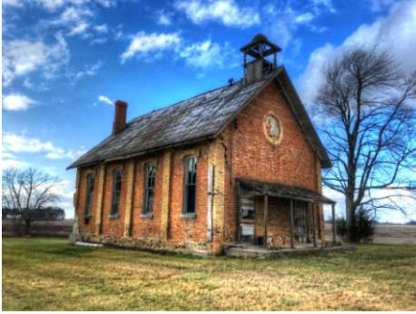
Lambton County Schoolhouse, 1860