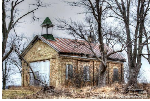
Section No.4 schoolhouse, Biddulph, ON