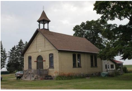
110 years old schoolhouse Cargill, ON