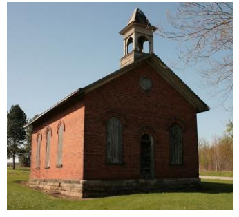
Schoolhouse Rugby, ON