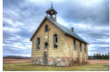
School Section No. 10, Hay, ON