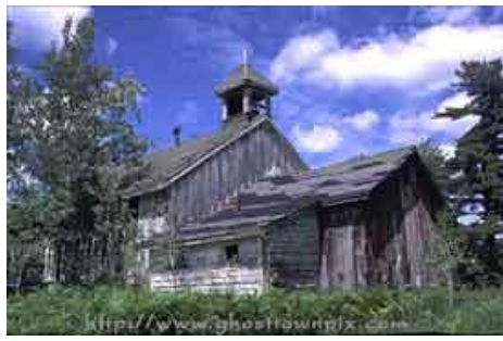
Schoolhouse 1872, Germania, ON