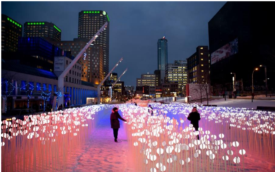
"Entre les Rang/Luminothérapie," Kanva, 2013-2014.

(image to the left) "Fantastic Planet," Parer Studio, 2019.