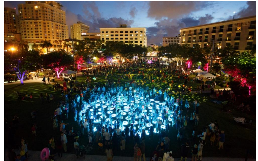
"The Pool of Light," Jenn Lewin, 2008 to Current. City of Mississauga Permanent Public Art Collection.