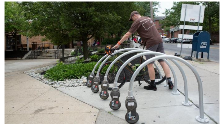
Sustainable Meter Rack, Lehigh University Design Collective, 2017.