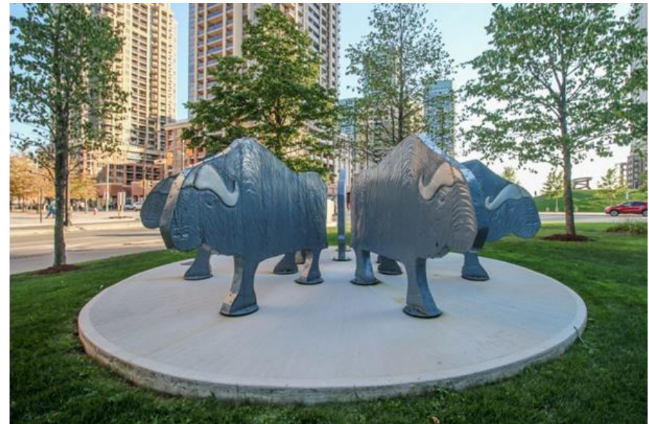
"The Bearded Ones," Tom Benner, 2017. City of Mississauga Permanent Public Art Collection.