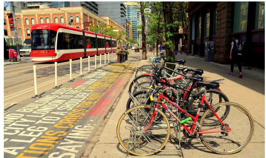
"Asphalt Poetry," PLANT, 2018, City of Toronto Everyone is King Design Build Competition.