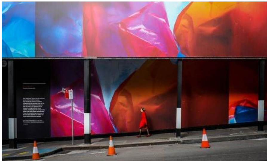
Creative Hoardings Program, TOKO, 2016. City of Sydney.