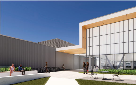
View of East Entrance